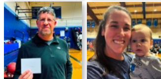
Boys Ice Hockey Pink in the Rink Event